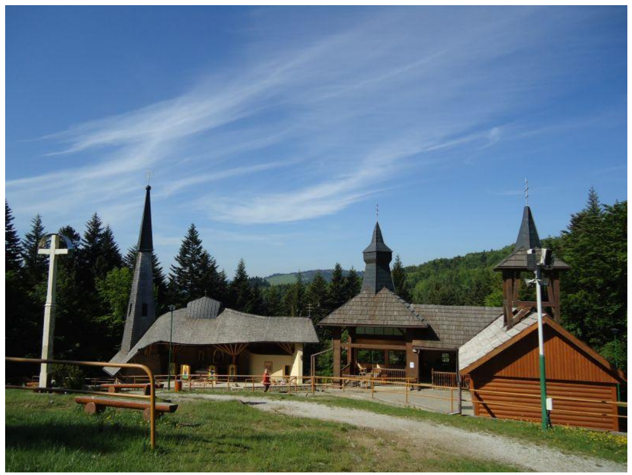
Fig. 5 Pilgrimage area at Zvir

(http://www.horazvir.sk/historia.php,http://casopisslovo.sk/wpcontent/uploads/archiv/0821.pdf).