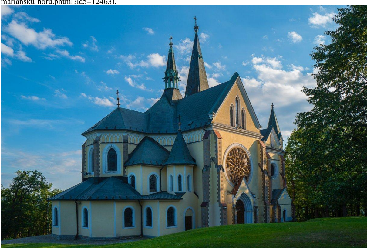
Fig. 2 Basilica of the Visitation of the Blessed Virgin Mary, Marian Hill in Levoča

(http://rkc.levoca.sk/put.html,http://rkc.levoca.sk/k_marianskahora.html,http://www.levoca.sk/put-namariansku-horu.phtml?id5=12463).