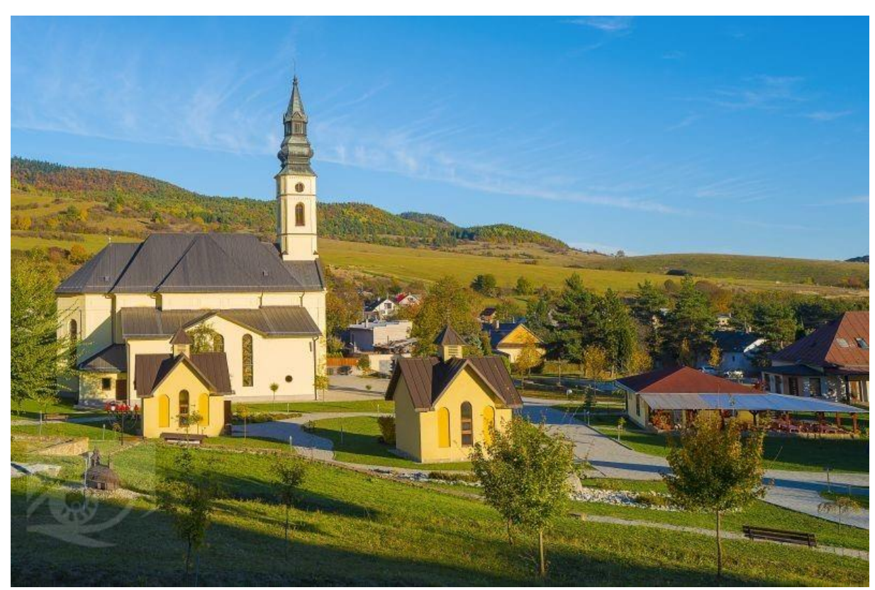
Fig. 4 Basilica of the Dormition of the Mother of God in Lutina