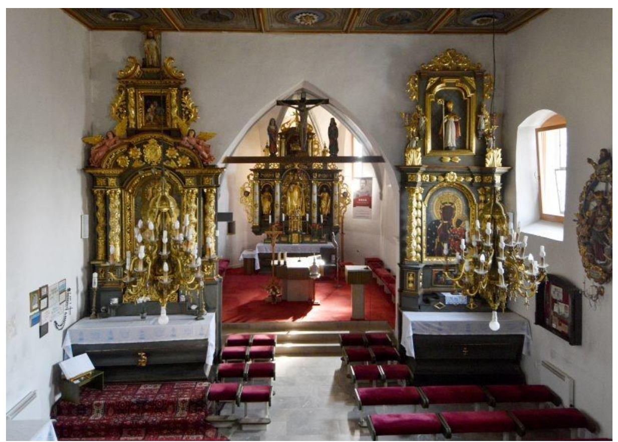
Fig. 3 Interior of the Church of St. Vojtech (St. Adalbert) in Gaboltov (www.severovychod.sk)