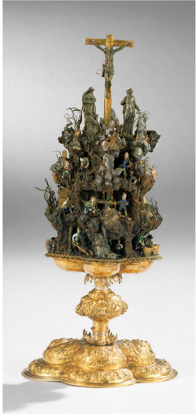
Fig. 7: Handstein mit Bergwerk und Kreuzigung Christi (Handstein (Handstone) with Mine and Crucifixion of Christ). Caspar Ulich, 2 nd half of 16 th century, Jáchymov (Joachimsthal), Bohemia. 30 cm × 14 cm × 11 cm. Kunsthistorisches Museum, Kunstammer Inv. No. KK 4157, Room XXIV. Photo: KMW.