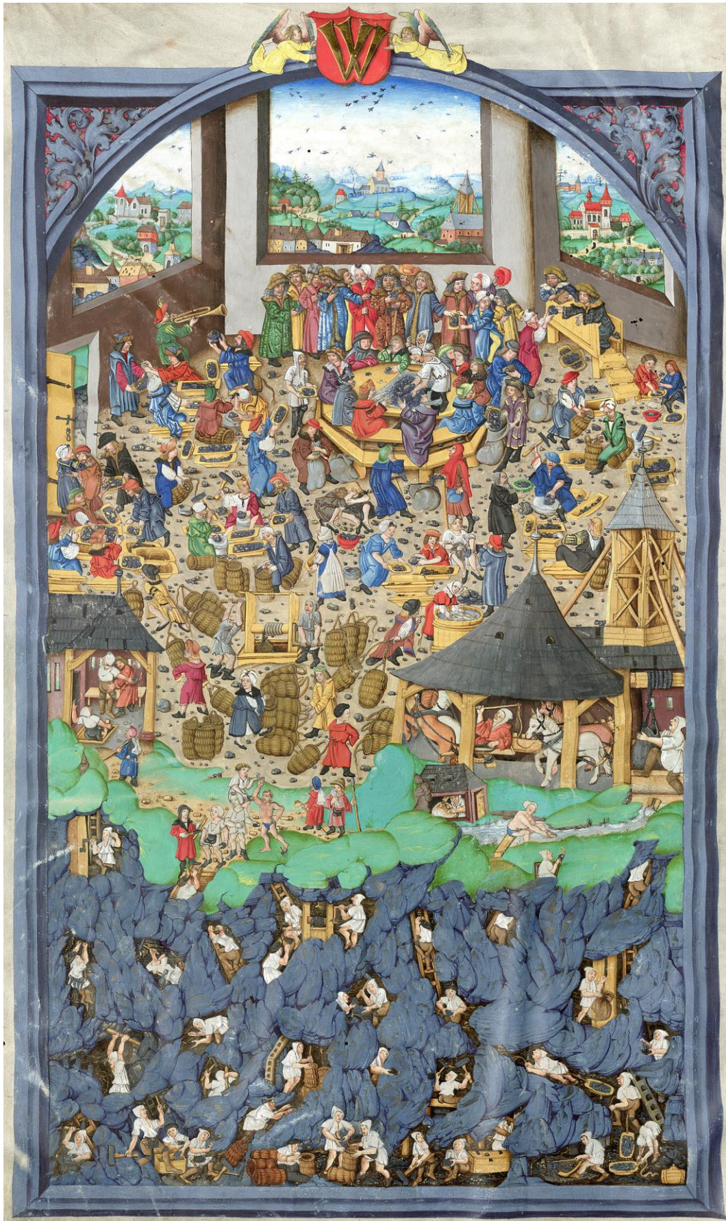
Fig. 3: Kutna Hora Gradual shows various details from mining, processing and trade of silver ores (Cantionale, Wien)