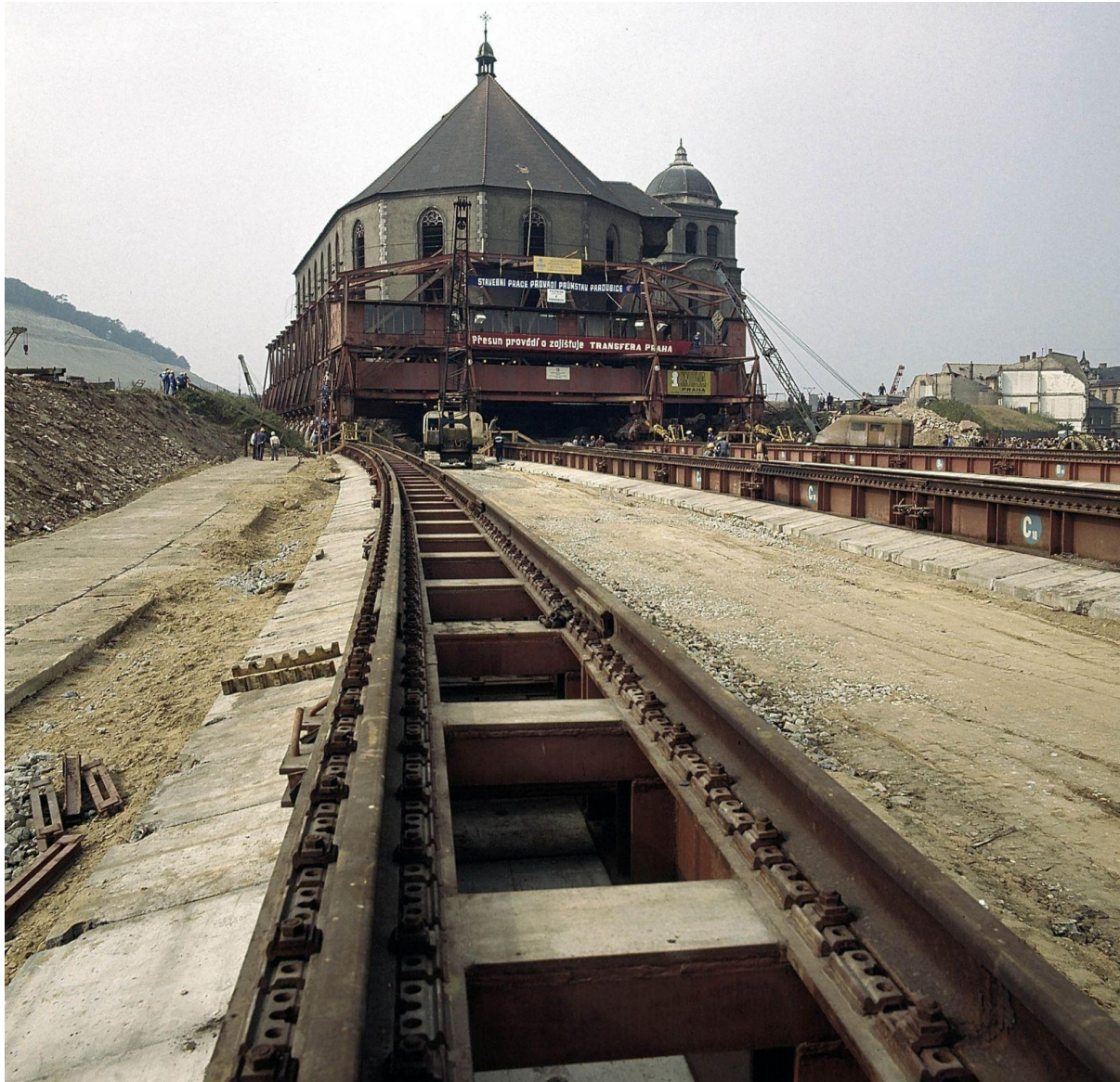
Fig.13: Movement of the Church of The Assumption of the Blessed Virgin Mary in Most, before the advancing coal open pit.

Most is a former historic town. Historic center of Most was demolished in behalf of progress and lignite (steam coal) mining. One of the preserved monuments is the late gothic Church of Nanebevzetí Panny Marie (Church of The Assumption of the Blessed Virgin Mary). This temple was built on the site of an old burned down church, the construction lasted from 1517 to the 17 th century. In 1975, the church was moved by 841.1 meters (2759 ft) on a rail chassis to a new place outside coal mining area. It is therefore another sacral monument directly related to mining (Přesun, 1976; Koukal, 2007)