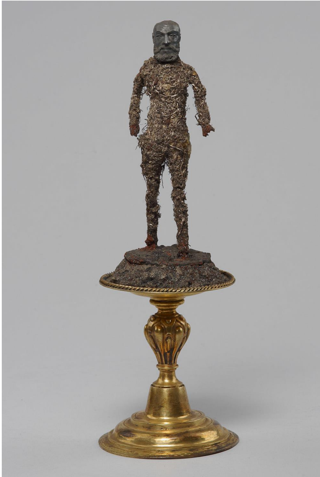
Fig. 8: Handstein mit bärtigem Mann (Handstein (Handstone) with a Bearded Man). Caspar Ulich, 2 nd half of 16 th century, Jáchymov (Joachimsthal), Bohemia. Height 20,6 cm. Kunsthistorisches Museum, Kunstammer Inv. No. KK 4162, Room XXIV.