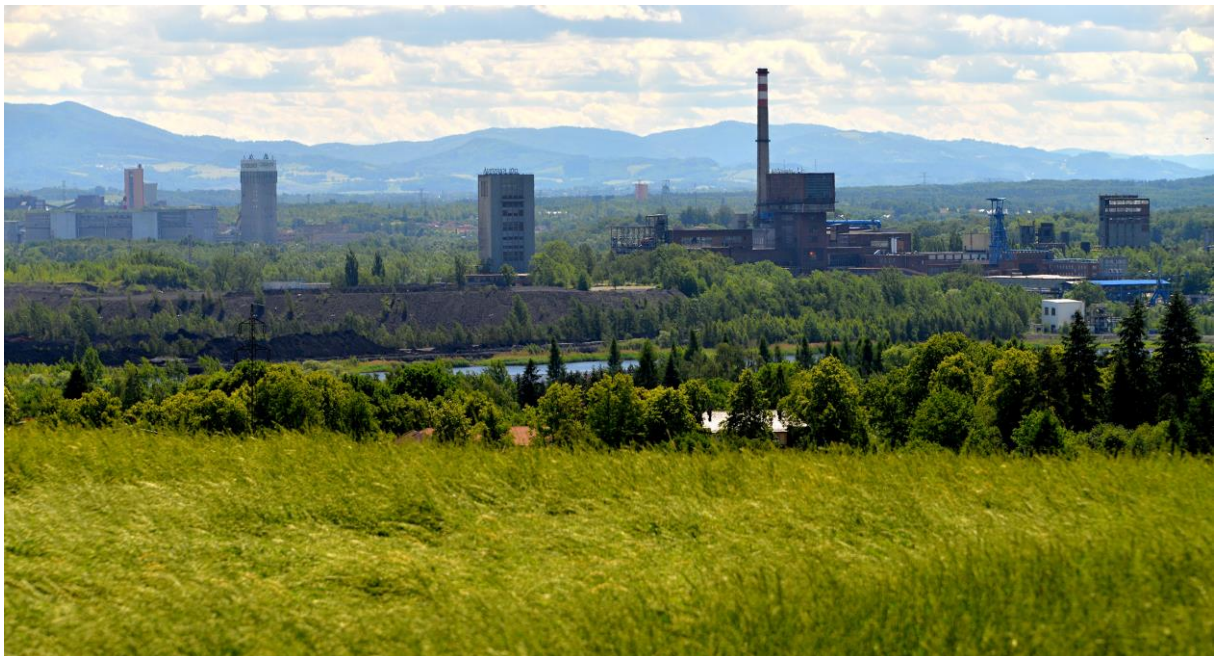
Fig. 13: Mining cultural landscape in Karviná is an example of a living prosperous industrial landscape, bringing prosperity to the whole region.