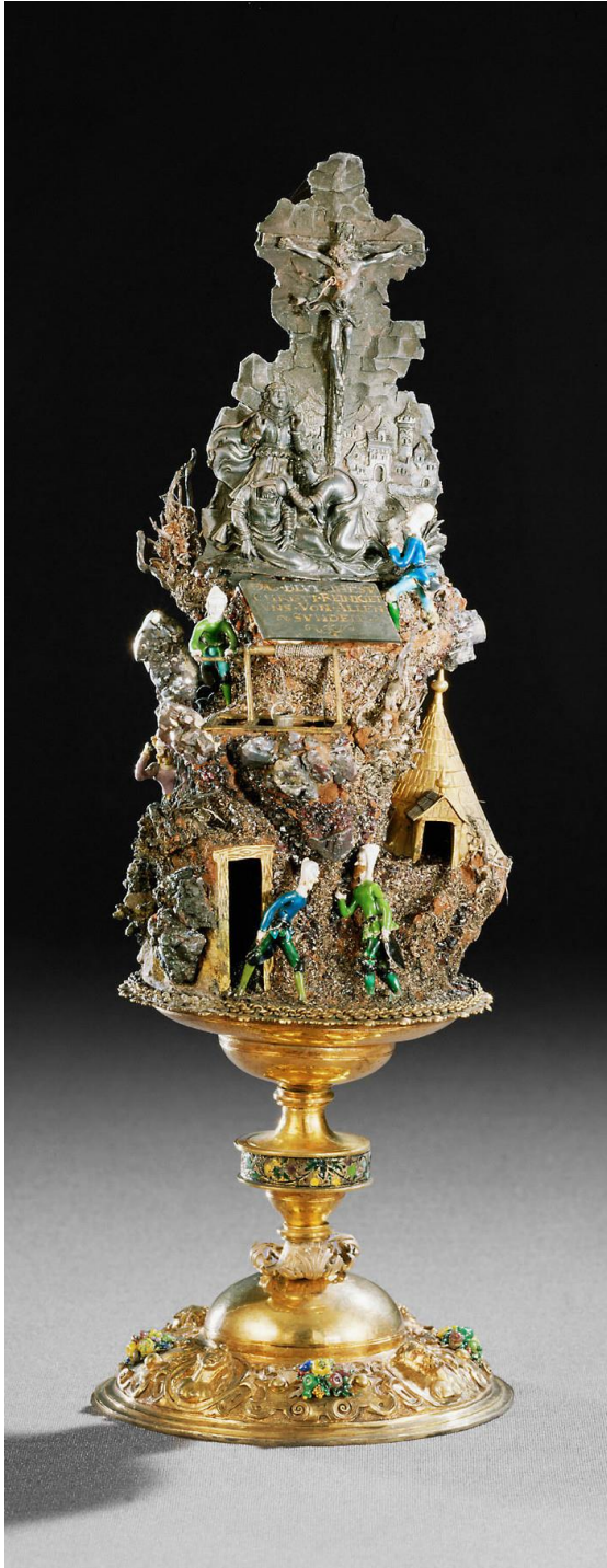
Fig. 6: Handstein mit Kreuzigung und Auferstehung Christi. (Handstein (Handstone) with crucifixion and resurrection of Christ) - Caspar Ulich, 2 nd half of 16 th century, Jáchymov (Joachimsthal), Bohemia. 30 cm × 14 cm × 11 cm. Kunsthistorisches Museum Wien, Kunstammer Inv. No. KK 4149, Room XXIV.