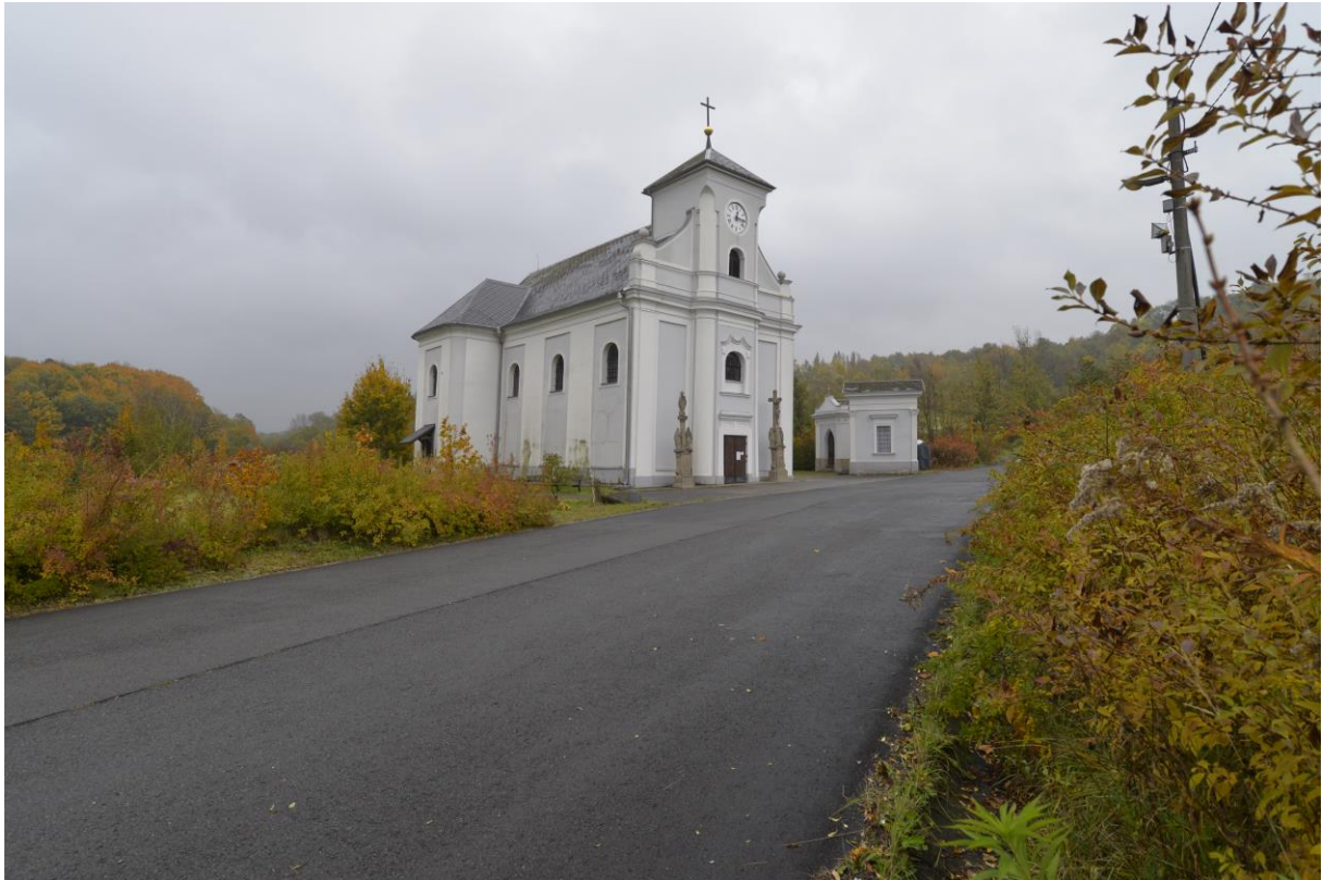
Fig. 12: Church of St. Petr (Peter) of Alkantara in Karviná dropped by 37 meters due to coal mining underground.