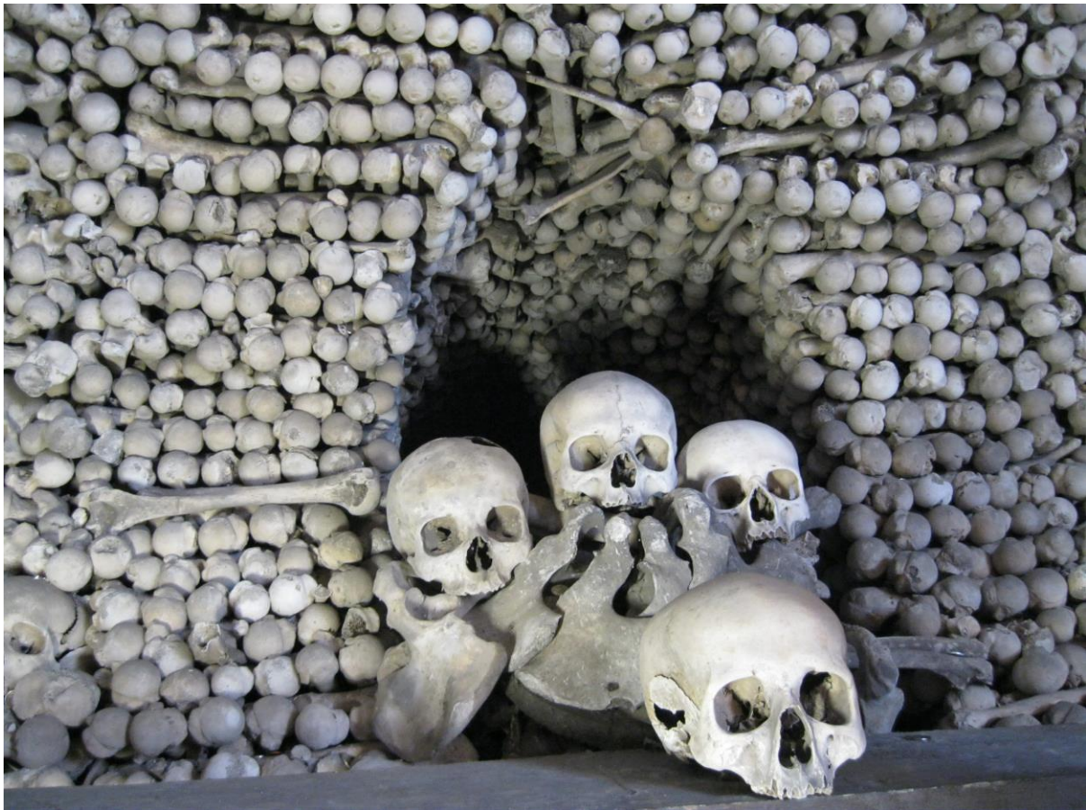
Fig. 2: An ossuary in the Chapel of Všech svatých (All Saints) under the All Saints cemetery church of Cistercian monastery in Sedlec – Kutná Hora.