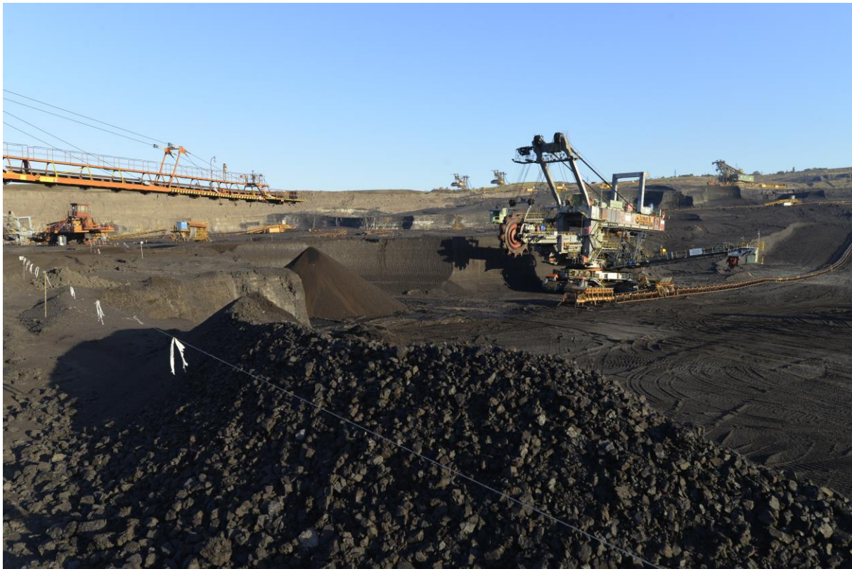
Fig. 14: CSA Open Pit near Most. It is not exactly the most beautiful landscape, but coal open pits give us high quality and nowadays more environmentally friendly electricity and heat.