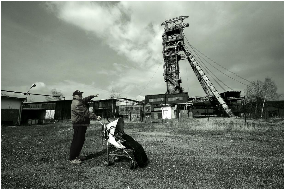
Fig. 10: Uranium Shaft No. 16 in Háje near Příbram is probably the deepest shaft in Europe in one vertical length 1838,4 m (6031 ft). The deepest uranium mines in the Europe were in the GDR in the Schlema-Alberoda area, there is vertical difference nearly 2000 meters between the upper shaft and bottom of the deepest "383IIIbis" blind shaft, the absolute depth at the deepest point reached 1,470 meters below sea level in the cascade of shafts. The deepest mine below sea level in Europe was the anthracite mine Ibennbürren in the BRD, which reached a depth of 1630 meters below sea level in the year 2012. The shaft No. 16 near Příbram is situated at a higher position, shaft collar is 596 meters above sea level, so Shaft 16 reached a depth of 1242 below the sea level.