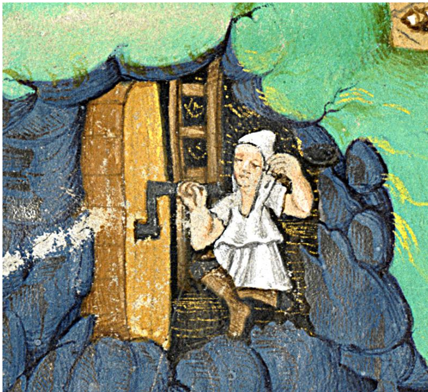
Fig. 4: The age of Kutná Hora Gradual is estimated at the turn of the 15 th and 16 th centuries. Detail of wooden hand fan in mines of Kutna Hora (Cantonale, Wien).