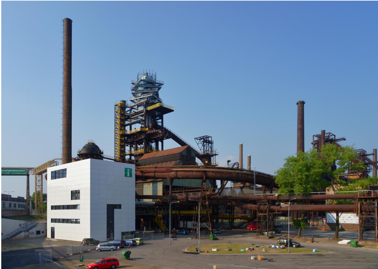
Fig. 11: Vitkovice Ironworks, Cokery Plant and Hard-coal Mine "Hlubina". National cultural monument of Czechia (the highest form of cultural monument protection). Despite the highest possible status of monument protection, Vitkovice Ironworks was damaged by ambitions of architects and local politicians to build their own monument here in the form of various inappropriate building extensions. For example "Usain Bolt Tower" on the top of Blast Furnace No. 1. Photo: Martin Přibil, 2015.