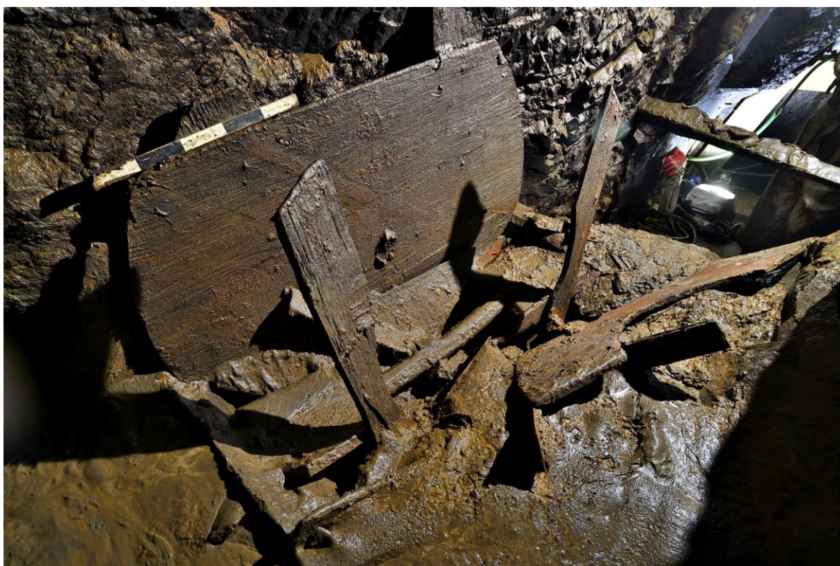
Fig. 5: A wooden hand fan found in an abandoned mine "Bylanka 4". The wooden hand fan dendrochronologically dates back to 1520. The form corresponds with the figure 4 from Kutná Hora Gradual.