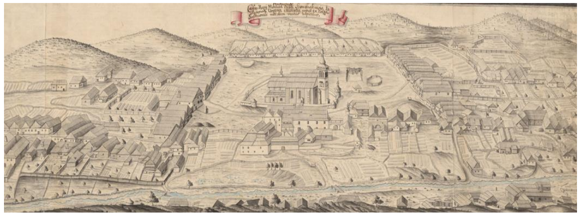
Fig. 4. Town Smolník in 1748

German naturalist and doctor Georgius Agricola (1494-1555) also writes about the phenomenon of cementation water from Smolník in one of his numerous works called De natura eorum, quae efluunt ex terra (1546): "This is where this kind of water is pumped from wells and flows into gutters. There, the water eats away at the iron extracted by local miners, which later changes its colour and turns into copper" (Tibenský and Urbancová, 2003).