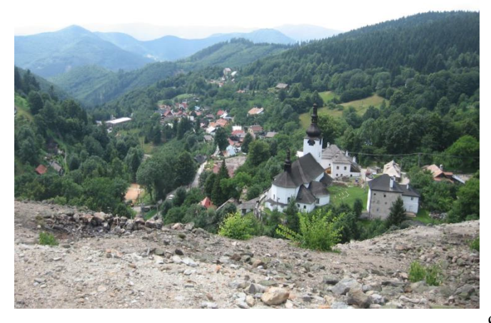
Fig. 3. Špania Dolina village