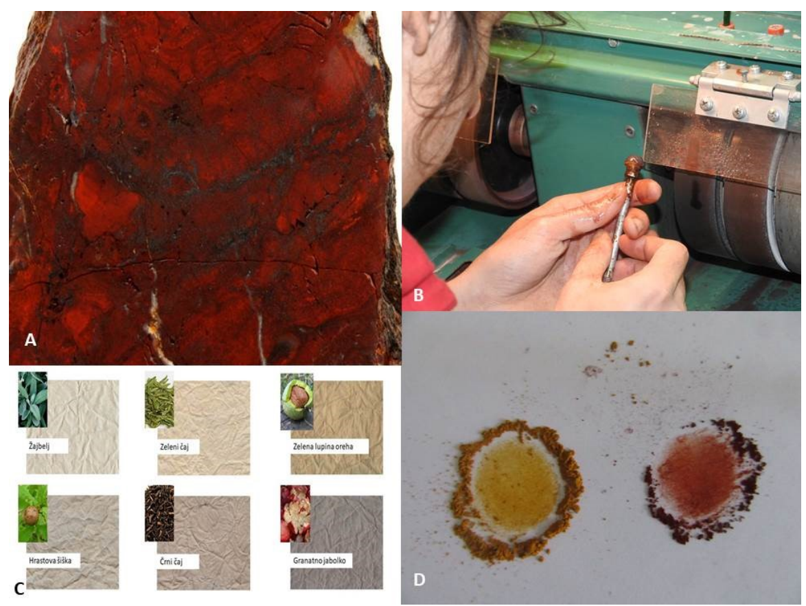
Fig. 4 Mineral potentials of the Sitarjevec mine: A – Hematite with jasper, B – Jewellery cutting, C – Textile dyeing with mine water and organic tinctures, D – Pigment