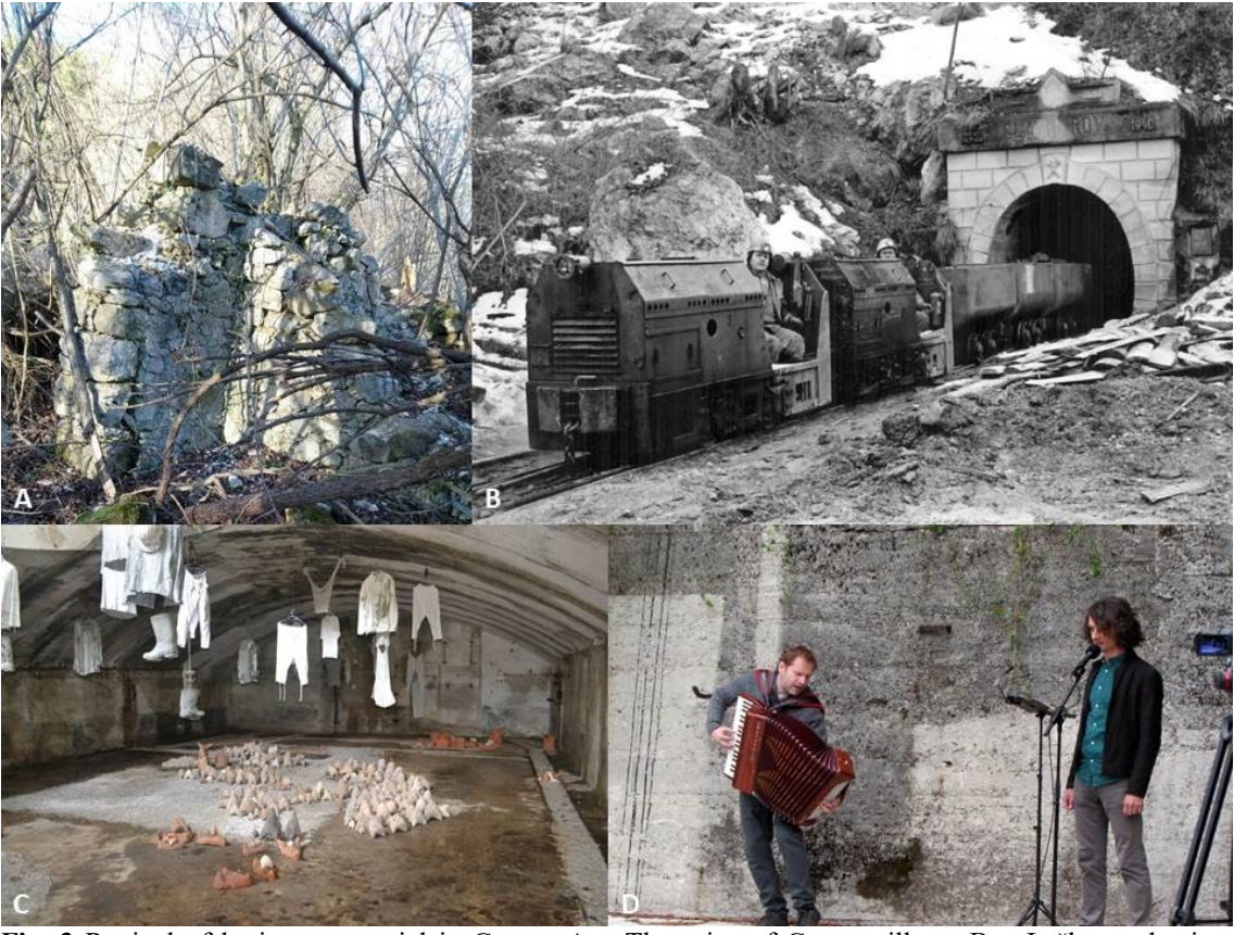
Fig. 3 Revival of heritage potential in Govce: A – The ruins of Govce village, B – Laško coal mine, C – Strojnica Gallery featuring the Odstiranja and Sence exhibitions, D – Music event in front of the Strojnica Gallery