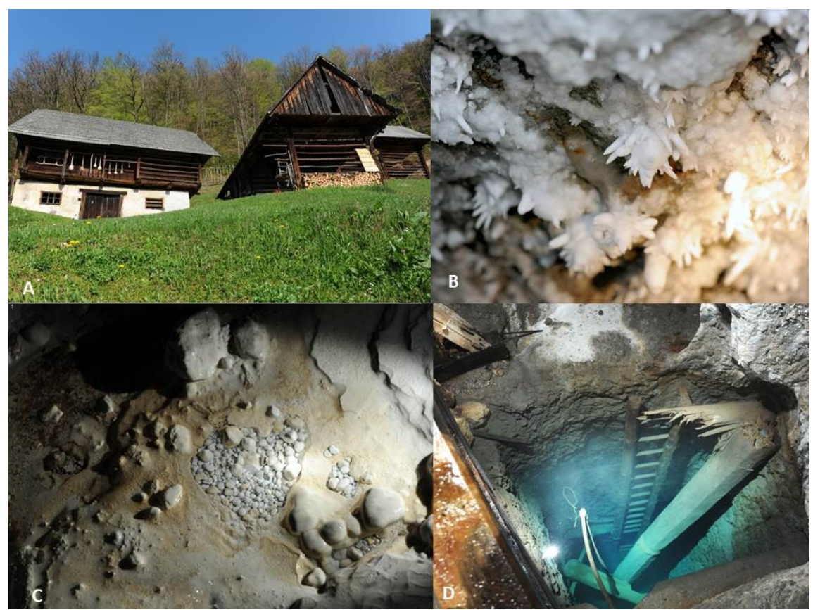
\textbf{Fig. 2} \ A-Slap \\ \"{s} ak \ homestead, \ B-Aragonite \ urchins, \ C-Cave \ pearls, \ D-Drinking \ water \\ catchment in the shaft