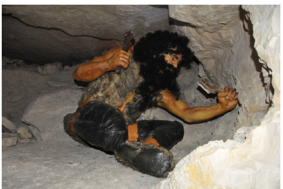
Fig. 1 Reconstruction of exploitation in former flint mine in Archeological Museum "Krzemionki", Poland

offer tailored to these needs (Kobylańska, 2013). This adaptation may relate to the age, the possibility of concentration and interest of the various groups of visitors, e.g. for school groups works best the combination of education with fun (edutainment).