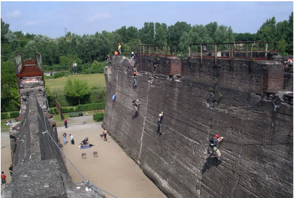
Fig. 3 One of the many climbing routes on the site of the former metallurgical Thyssen complex in the Landscape Park "Duisburg Nord", Germany.

product and its component elements. at least Knowing some of those expectations, you can adjust to them the tourist offer and accordingly shape the message. among others. advertising message. The form and the content of the argumentation offering travel services affect the decisions of the visitor, because they largely shape his ideas. The message referring to the tourist imagination also acts on all actors on the mining heritage market, including public opinion. The success of the tourist product may also motivate others to products create new (services) or complementary to the existing offer. Thanks to these the same relics of mining activities serve to create a variety of goods and services for different consumer groups and market segments.