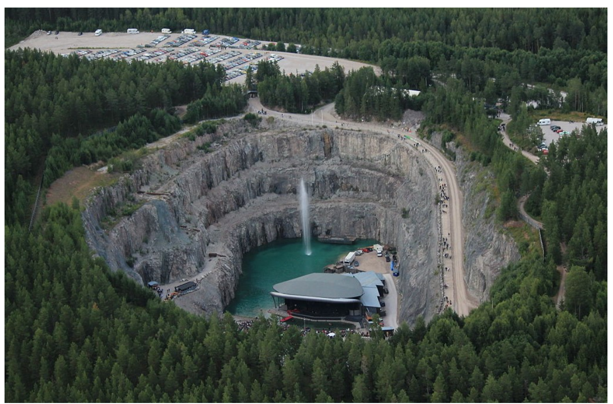
Fig. 4 The concert in the Dalhalla amphitheater in the excavation of the limestone exploitation in Rättvik, Sweden.

investment projects, subordinate to the laws of the free market economy, even though the processes related to the protection of tangible and intangible cultural heritage and revitalization projects are not fully commercial. For this reason, due to demand parent - participation of the state in subsidizing the revitalization projects and projects related to the protection and promotion of geo-diversity.