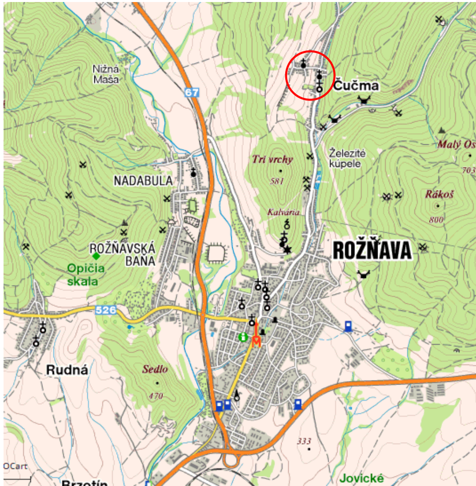
Fig. 1 Location of the village

eight information boards. Route can be passed on foot or by bike. The content of individual panes highlights the mining past of the village, describes mining, ore processing and mineral resources.