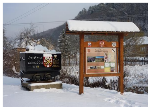
Fig. 2 Leading board of the nature trail

in the early 90s and they were stored directly on a computer disk or CDs. Their functionality from existing maps is virtually no different. The actual development of interactive maps, however, occurs with the birth of web network when the maps become easily updatable and also accessible to the general public, what has given rise to the formation of different geo-portals.