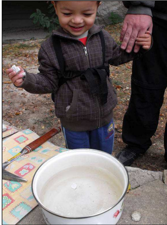
Fig. 4 II. Hungarian Geosite's Day – Cserépfalu 2009; The pumice is floating on (is'nt sinking in) the water because of its high porosity. Just try it!