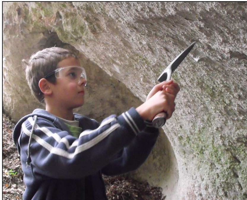
Fig. 3 II. Hungarian Geosite’s Day – Cserépfalu 2009. Especially children were enthusiastic to improve physical properties of rhyolite tuffs and searching pumice stone lapilli in the village’s old quarry

At the geosites not only geological, mineralogical and geographical information was given about the presented materials and objects, but also on its economical, environmental or cultural importance it was pointed out. For example, the rhyolite tuff stones were used as popular building material for houses and wine cellars in the neighboring villages and on the guided tour also some minerals in stone walls were discovered by the participants. Finding pumice stone lapilli and other volcanic products in a village’s quarry is a good occasion to learn about volcanoes, but there also turns up a question: “why was rhyolite tuff to quarry?” From the components of the parent materials, through surface development processes up to the quality of local building materials and landscape history linkages of geological knowledge could be explained (Fig. 3 and 4).