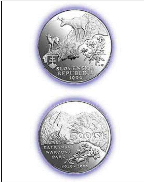
Fig. 4 Obverse and reverse of the Tatra NP silver commemorative coin