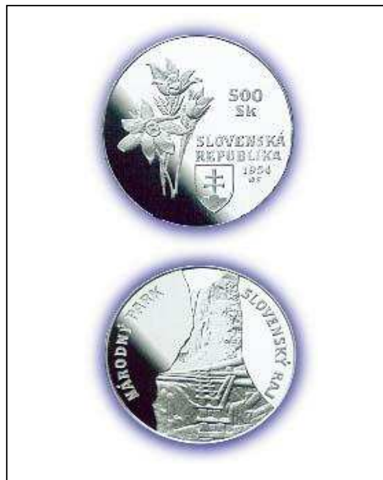
Fig. 2 Obverse and reverse of the Slovak Paradise NP silver collectors' coin

The first silver coin devoted to nature protection minted in the 1994 was 500 Sk denomination and depicted was Slovak Paradise NP (see Fig. 2).