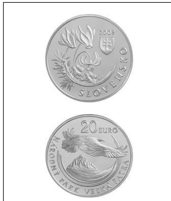
Fig. 9 Obverse and reverse of the Veľká Fatra NP silver collectors' coin

Silver collectors' (numismatic) coin with denomination of 20 € devoted to nature and landscape protection - Veľká Fatra NP was minted by NBS in 2009 (see Fig. 9).