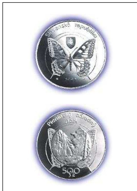
Fig. 3 Obverse and reverse of the Pieniny NP silver collectors' coin

The author of coin design is Mgr. Art. Patrik Kovačovský, the engraver of coin is Dalibor Schmidt. Coin producer is the Kremnica Mint, basic parameters of coin are as follows: weight 33,63 g, diameter 40 mm, material Ag 925/1000 Cu 75/1000.