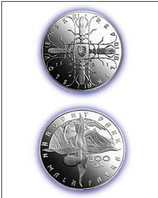
Fig. 5 Obverse and reverse of the Malá Fatra NP silver commemorative coin

Silver commemorative coin with denomination of 500 Sk devoted to nature and landscape protection - Slovak Karst NP was minted by NBS in 2005 (see Fig. 6). The author of coin design is Mária