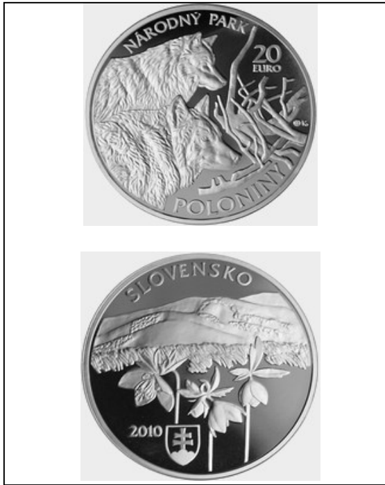
Fig. 10 Obverse and reverse of the Poloniny NP silver collectors' coin