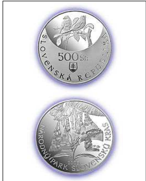
Fig. 6 Obverse and reverse of the Slovak Karst NP silver commemorative coin

Poldaufová. Coin producer is Bižutérie Czech Mint in Jablonec nad Nisou, gravers of this coin are Libuše Franckeová and Ivan Eyman. Basic parameters of coin are as follows: weight 33,63 g, diameter 40 mm, material Ag 925/1000 Cu 75/1000.