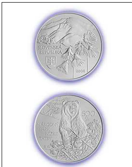
Fig. 8 Obverse and reverse of the Low Tatra NP silver commemorative coin

Silver collectors' (numismatic) coin with denomination of 20 € devoted to nature and landscape protection - Veľká Fatra NP was minted by NBS in 2009 (see Fig. 9).