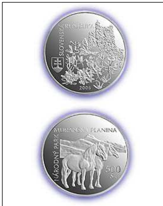
Fig. 7 Obverse and reverse of the Muránska planina NP silver commemorative coin