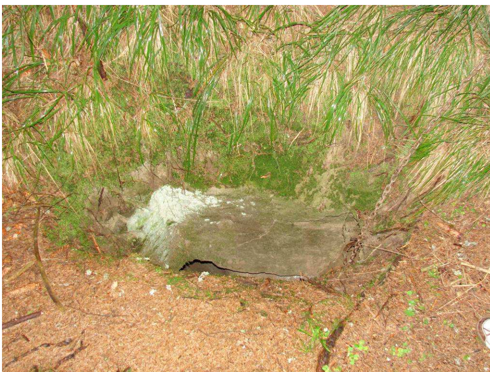
Fig. 3 Unknown hole (size of the leak is about 4 m 2 )