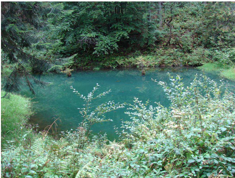
Fig. 2 Unknown lake